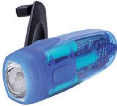
Figure 4: Freeplay wind-up flashlight (torch)