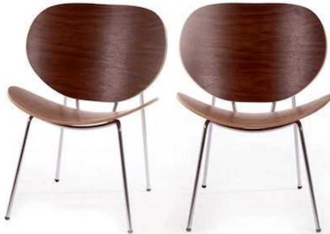
Figure 3: Odin chair