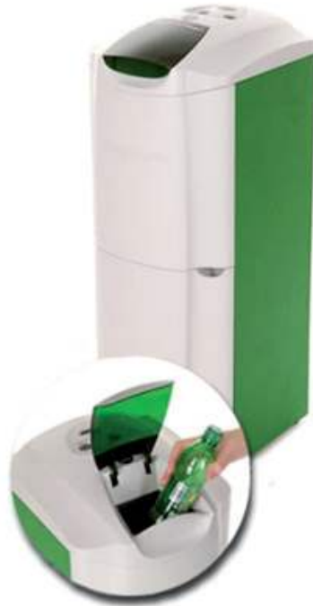
Figure 5: Minima Office Bottle/Can Crusher