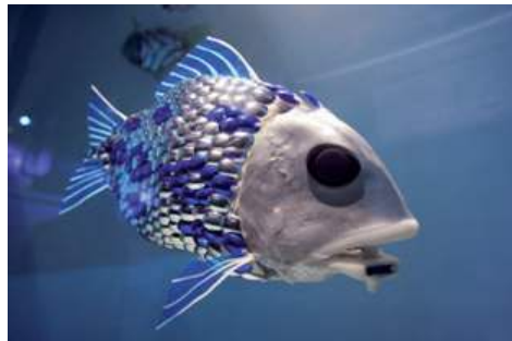
Figure 1: Robotic fish